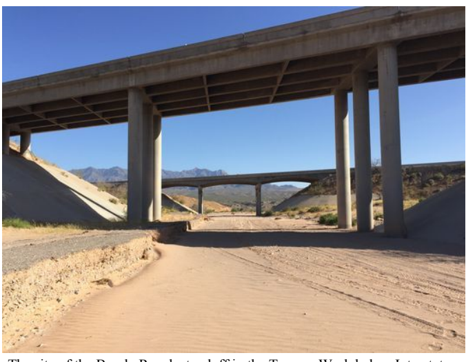
The site of the Bundy Ranch standoff in the Toquop Wash below Interstate 15 about 70 miles north of Las Vegas near Bunkerville, Nevada.

Images of Parker have come to epitomize the standoff. He is pictured in an iconic photo lying prone on an overpass and sighting a long rifle at BLM agents in the wash below. The image galvanized the public and brought international awareness to the feud over public lands and the potential consequences of such a dispute.