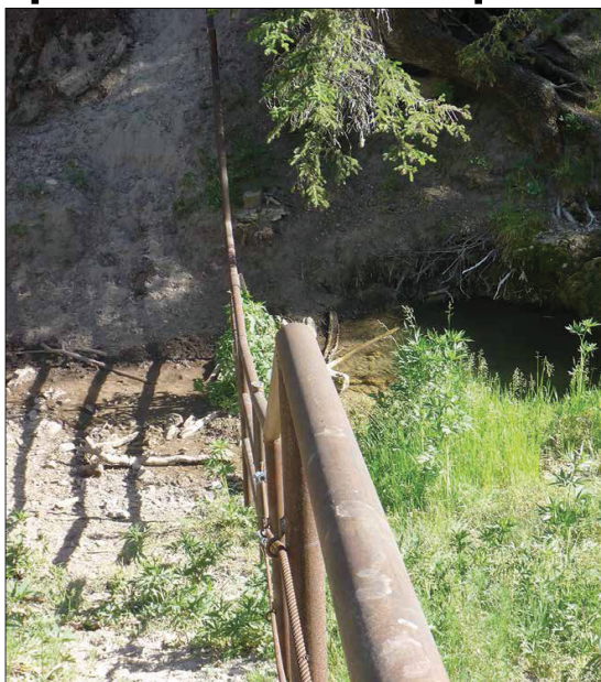
It appears the habitat protection project funded by sports men and built around sensitive riparian habitat in Lincoln National Forest is having the intended effect. In this photo taken several months after work finished, the left side is the area open to caltie while the right side is protected for wildlife.